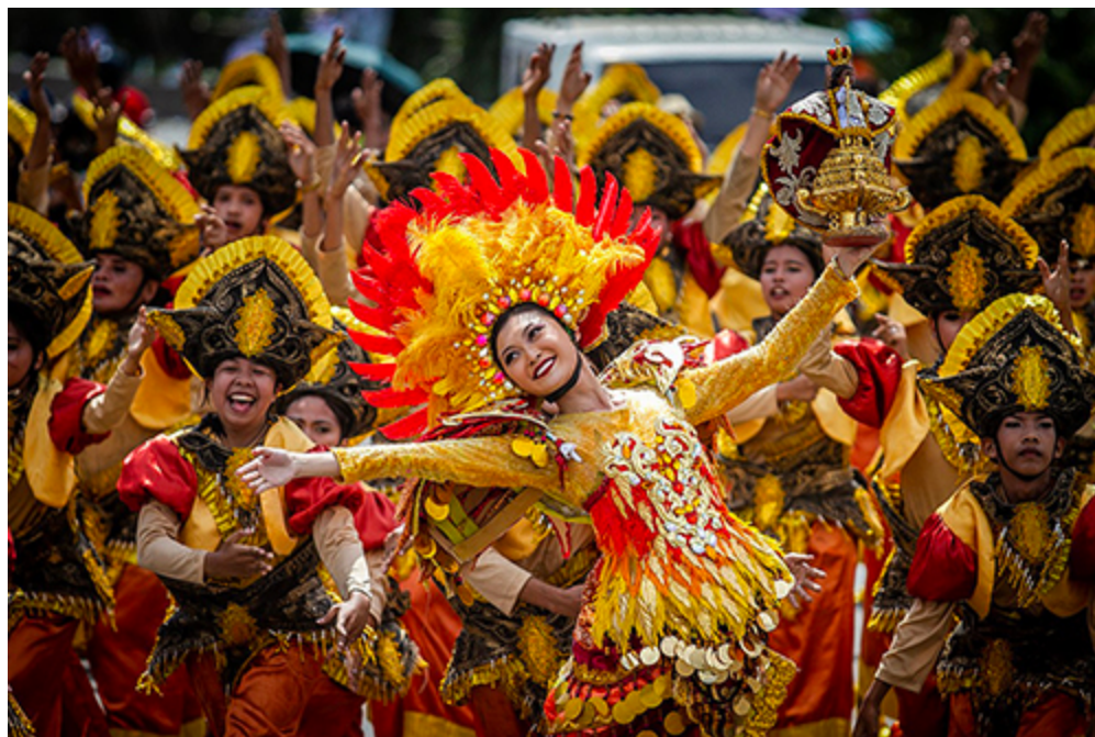
A beauty Queen showing her Santo Niño.

Above, a view on the new banners, seen yesterday noon in the center of Cebu City. They were hanging there for the first day and announce the upcoming Sinulog. The Sinulog Festival is the biggest event in the year, happening in Cebu City. It takes place every third Sunday in the month of January. It is the most anticipated annual event in the Philippines. Over 3 million people flock to Cebu city each year for this cultural and religious Festival.